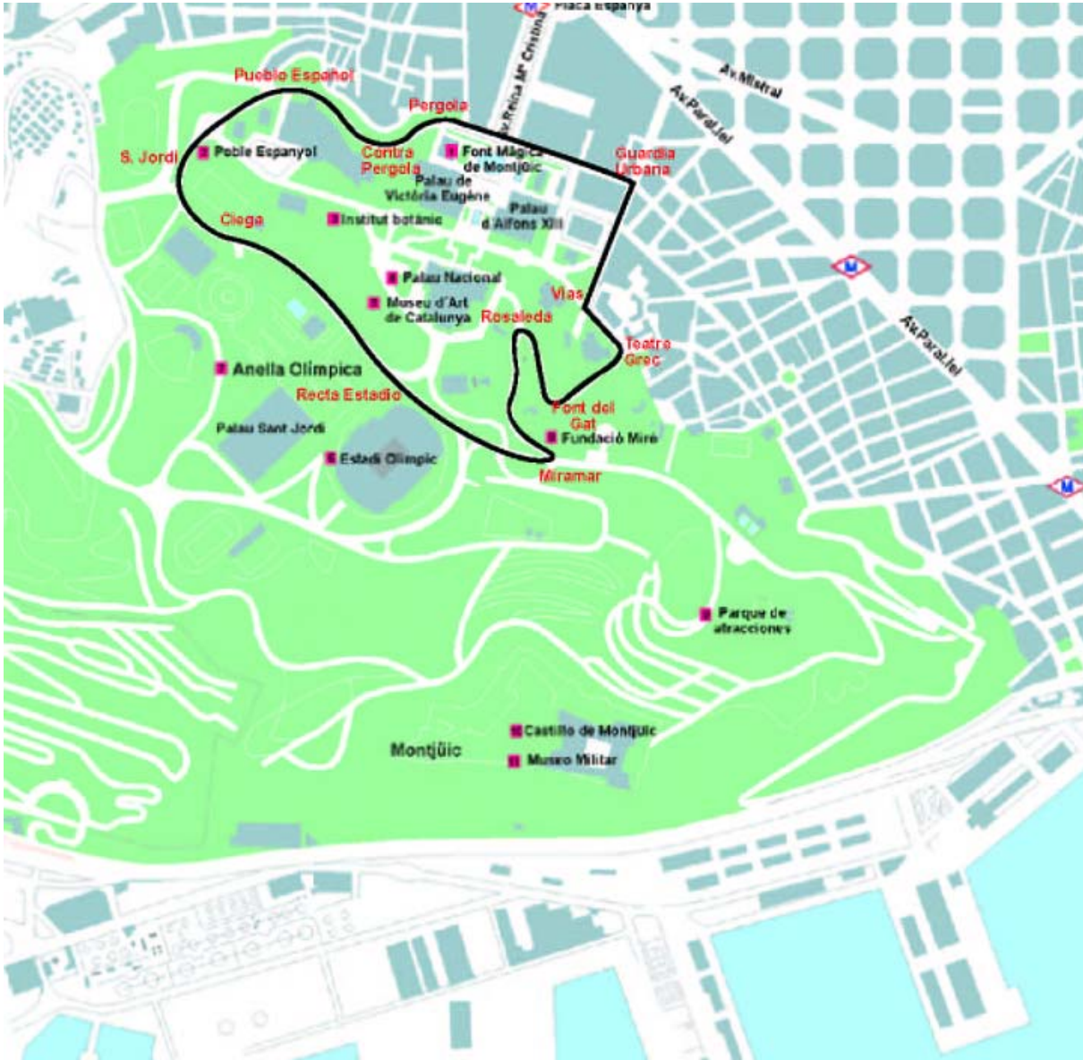
Old Circuit lane.